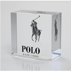
CATALOG SAMPLE ART