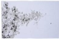
Sample Inside Page