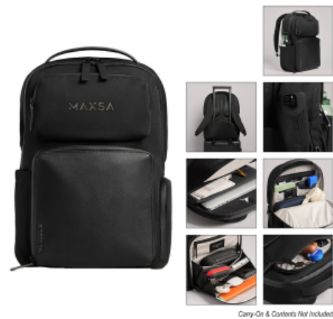
Carry-On & Contents Not Included