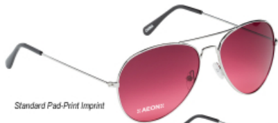
Standard Pad-Print Imprint