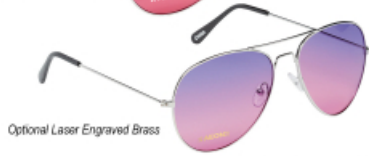
Optional Laser Engraved Brass